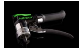
Compact Swage Tool