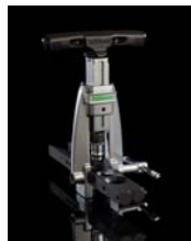
Quick-Engage Flare & Swage

hilmor has revolutionized the HVAC/R world by creating tools that are a step ahead. From gauges to thermostats to thermocouple clamps, hilmor has retooled some of your important on-the-job necessities by adding the features you need and removing the ones you don't.