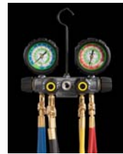
4-Valve Aluminum Manifold