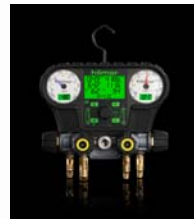
Electronic Gauge with Vacuum Sensor