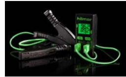
Dual Redout Thermometer