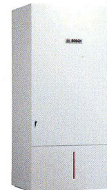
Greenstar Condensing Boiler or Combi Boiler*