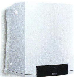
Buderus GB142 Condensing Boiler